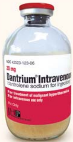
FIGURE 2. Dantrium® IV (dantrolene sodium for injection).

by 4 independent observers compared older and new Dantrium® IV with regard to reconstitution time, time of transfer, and withdrawal time (Figure 1). 24 A mean reconstitution time of 12.1 seconds was reported with the new Dantrium® IV. The packaging for the new Dantrium® IV has also been modified to reduce the time necessary for reconstitution. A red flip-off cap has been added to permit rapid opening of the vial, and a vacuum has been added to each vial to facilitate the entry of the diluent (non-bacteriostatic water) into the vial (Figure 2). All of these changes are significant and permit rapid mixing of Dantrium® IV. Dantrium® IV continues to have a shelf life of 36 months. 23 In October 2009, Health Canada approved the rapidly mixing Dantrium® IV for the Canadian market.